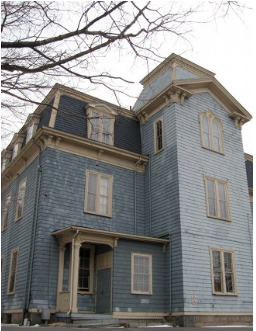
A Handsome Building in the City Center Deteriorates